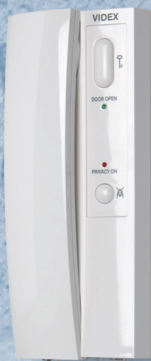
Art. 3125 Art. 3126 Art. 3176 Art. 3195 Art. 3196