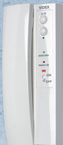
Art. 3114 Art. 3124 Art. 3181